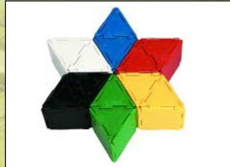
WTL 495 Jovo

The Jovo Click N Construct set sits in our construction section and although the packaging has become tatty and worn over the years, this toy is a fun and educational way to explore polygons and polyhedra. The pieces fit together with a click and hold together well, to form strong models. This toy is more suited for children from 4 years upwards although adults can have just as much fun as the kids. Particularly challenging is the construction of the large ball that can be made with this set.