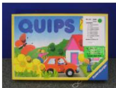
WTL 814 Quips