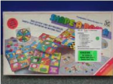
WTL 135 Shape a Rama