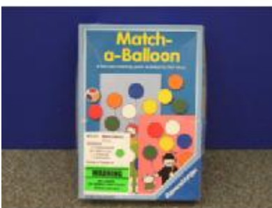
WTL 313 Match-a Balloon