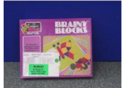
WTL 601 Brainsy Blocks