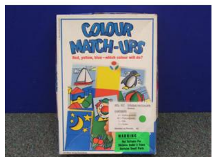
WTL 817 Colour Match Ups