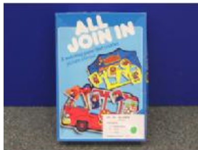
WTL 818 All Join In