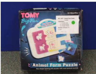
WTL 407 Animal Farm Puzzle