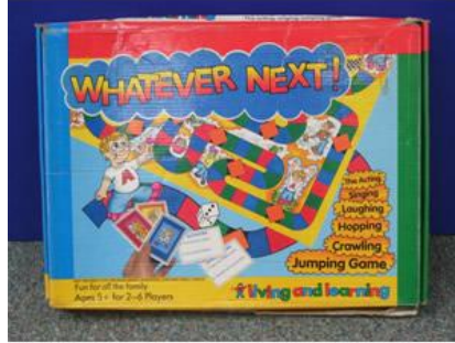
WTL 840 Whatever Next