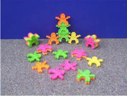
WTL 525 Stacking Acrobats