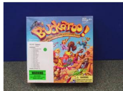
WTL 1617 Buckaroo