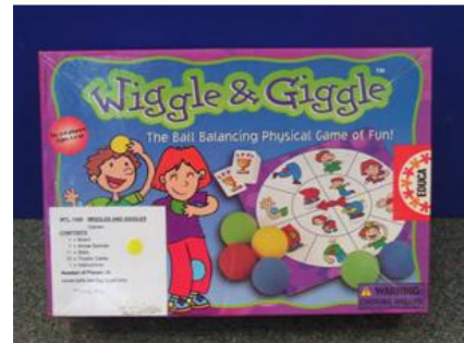
WTL 1430 Wiggle and Giggle