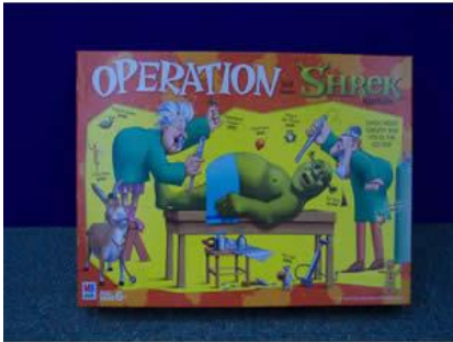
WTL 1620 Operation