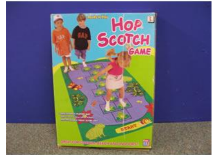
WTL 1736 Hop Scotch Game