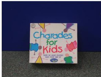
WTL 1349 Charades for Kids