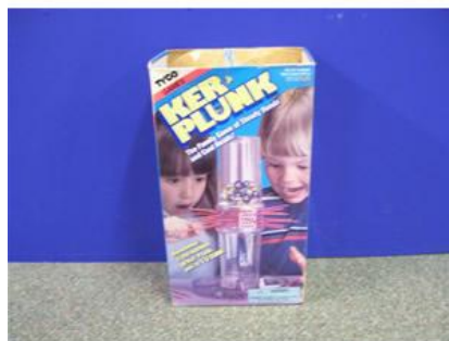
WTL 1496 Ker Plunk