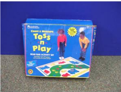
WTL 1244 Toss n Play