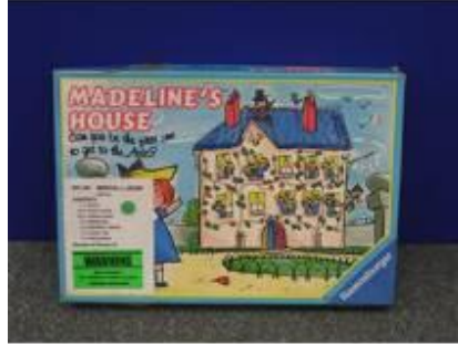
WTL 69 Madeline's House