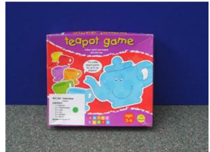
WTL 1530 Teapot Game