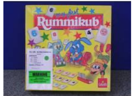
WTL 1266 Rummikub