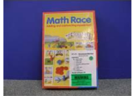
WTL 579 Math Race