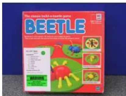
WTL 1618 Beetle