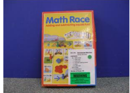
WTL 579 Math Race