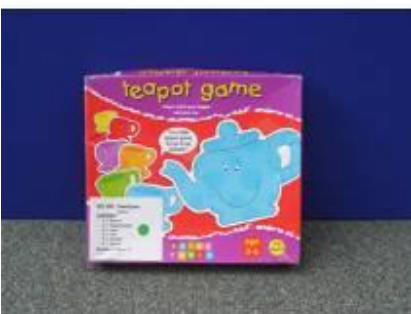
WTL 1530 Teapot Game