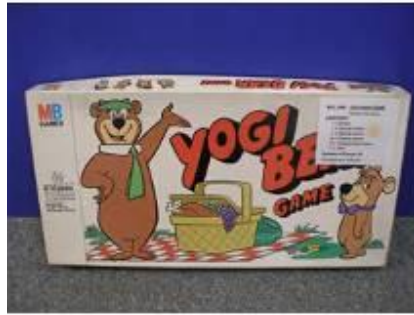
WTL 1480 Yogi Bear Game