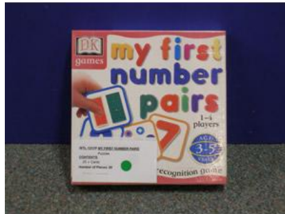
WTL 1217 My First Number Pairs