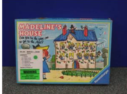
WTL 69 Madeline's House