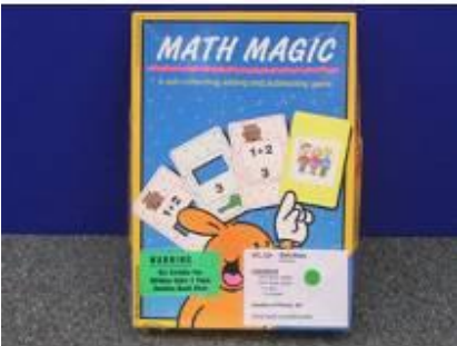
WTL 819 Math Magic