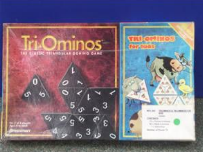
WTL 47 Tri-Ominos