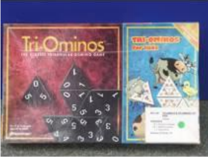
WTL 47 Tri-Ominos