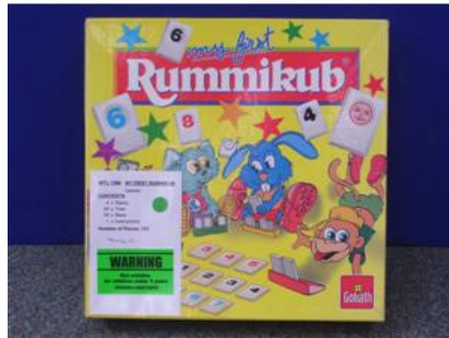
WTL 1266 Rummikub