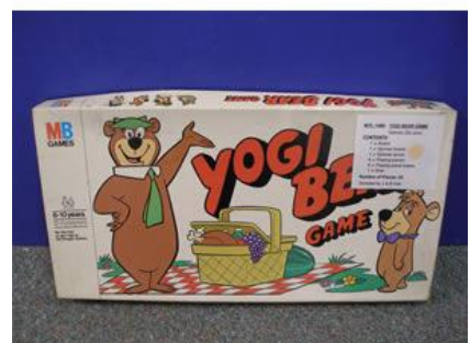
WTL 1480 Yogi Bear Game