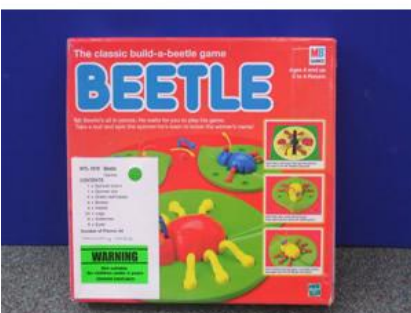
WTL 1618 Beetle