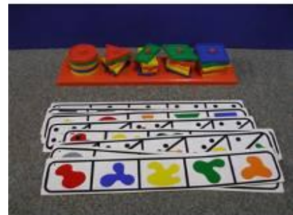
WTL 686 Geostacks