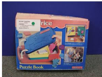
WTL 664 Puzzle Book