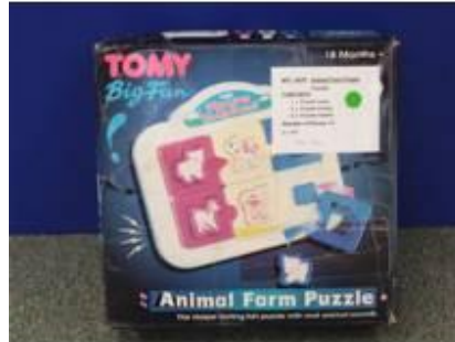
WTL 407 Animal Farm Puzzle