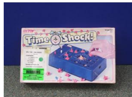
WTL 1108 Timeshock