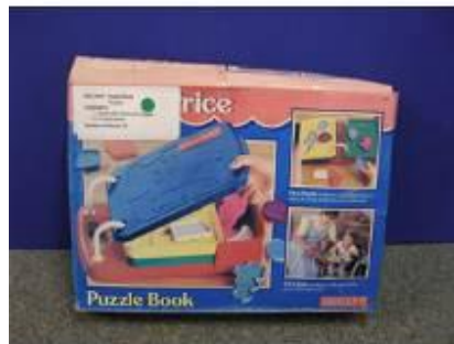
WTL 664 Puzzle Book