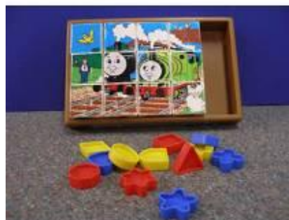
WTL 960 Box of Shapes