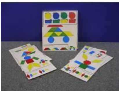
WTL 689 Logi - Shape Fun