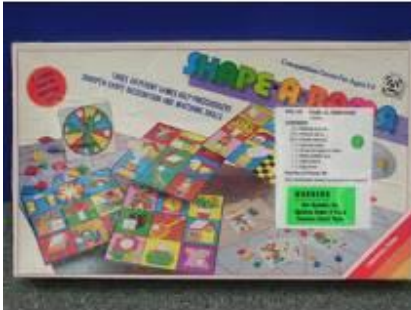
WTL 135 Shape a Rama