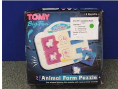
WTL 407 Animal Farm Puzzle