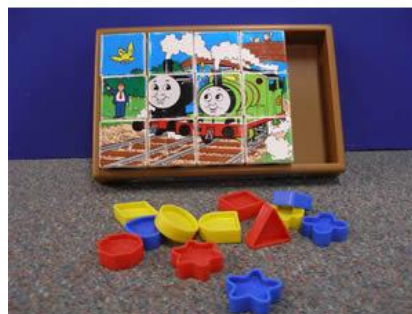
WTL 960 Box of Shapes