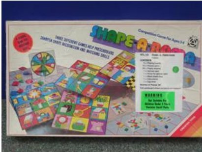
WTL 135 Shape a Rama