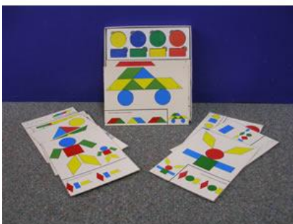
WTL 689 Logi - Shape Fun