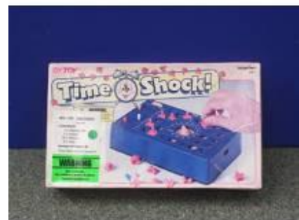
WTL 1108 Timeshock