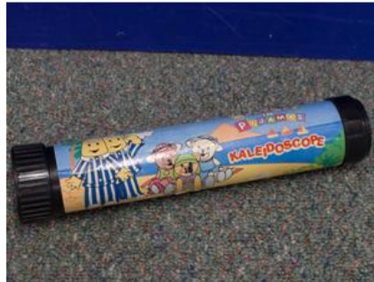
WTL 1857 Bananas in Pyjamas Kaleidoscope