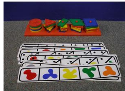
WTL 686 Geostacks