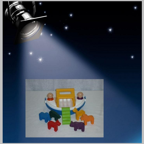
WTL 1542 – Noah's Ark

At first glance this Noah's Ark toy, made by Tupperware, seems to be just a fun toy to play with in the bath. Made from brightly coloured sturdy plastic, the ark comes with: Mr and Mrs Noah, giraffes, polar bears, elephants, rhinos, lions, and horses. Have fun gathering up the animals, putting them in pairs and making sure they are safely up the ramp into the ark before the Ark sets off for the deep depths of the bath tub. Although this toy is primarily a bath toy the animals double as cookie/playdough cutters and children can have heaps of fun making a whole zoo of different animals! And then there are the basic colour and shape recognition skills which this toy provides. Children match each animal with its partner by using basic colour and shape recognition skills.